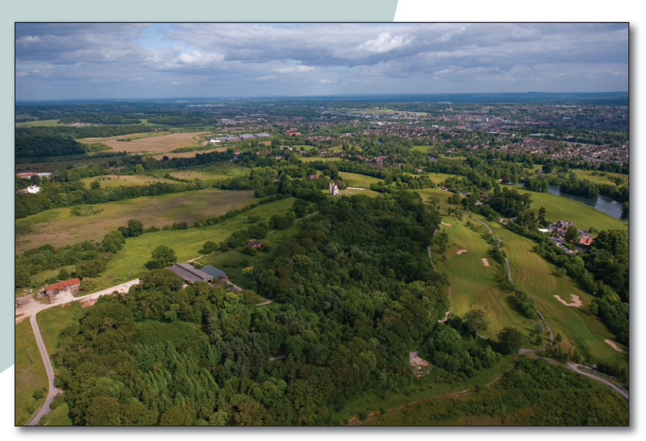
Donnington Castle with Newbury in the background.